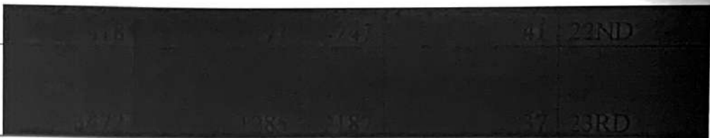
Table 7 shows the performance by facilities with regards to children dosed vitamin A (12-59 months), EPL recorded a 99%, while Oda Government Hospital had a lowest coverage of 37%.